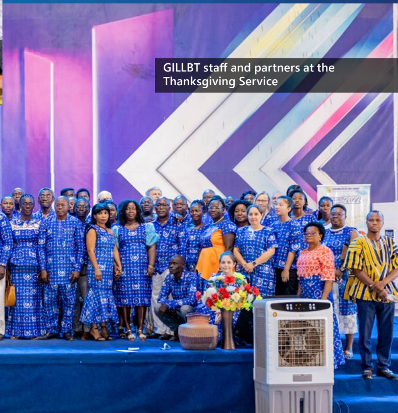
GILLBT staff and partners at the Thanksgiving Service