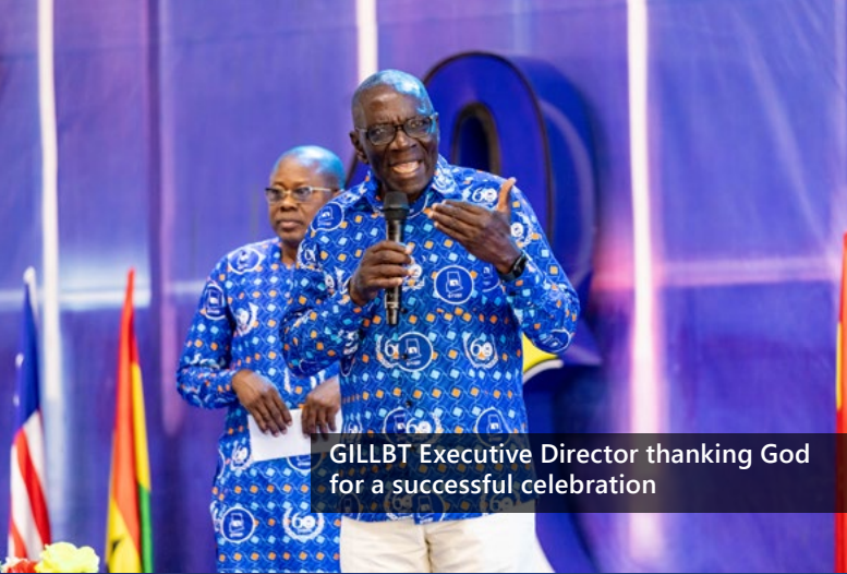
GILLBT Executive Director thanking God for a successful celebration