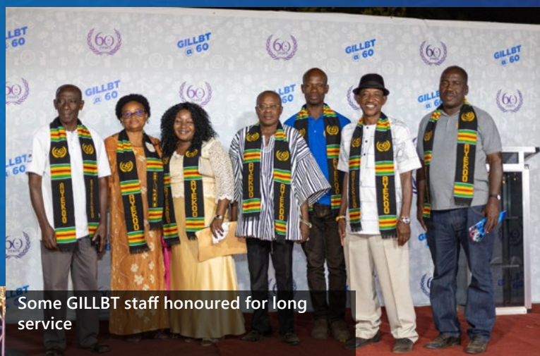
Some GILLBT staff honoured for long service