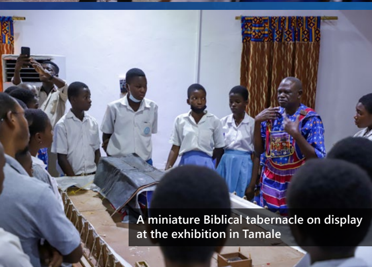
A miniature Biblical tabernacle on display at the exhibition in Tamale