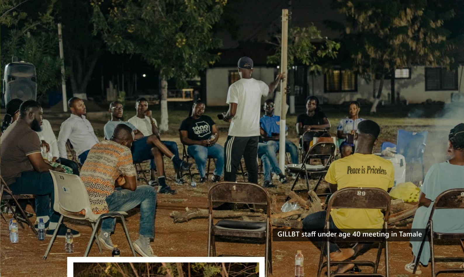
GILLBT staff under age 40 meeting in Tamale