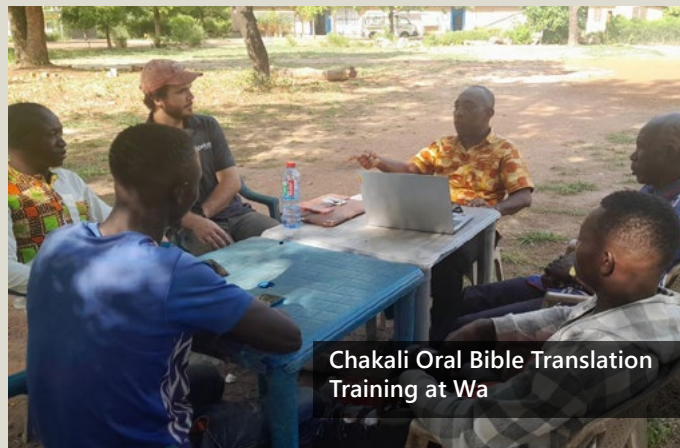
Chakali Oral Bible Translation Training at Wa