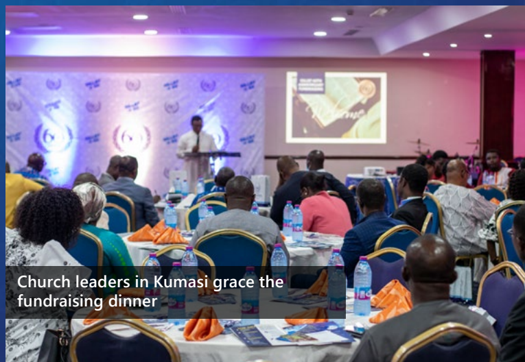
Church leaders in Kumasi grace the fundraising dinner