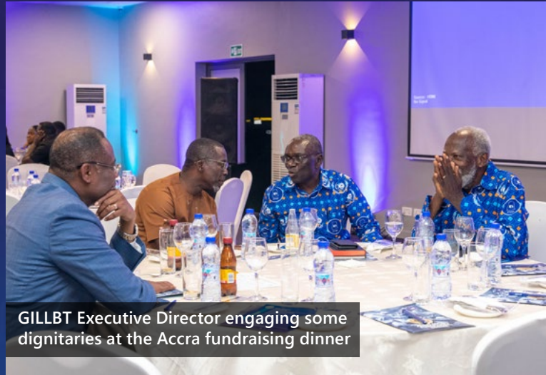
GILLBT Executive Director engaging some dignitaries at the Accra fundraising dinner

To God's glory both events were well organised and well attended.