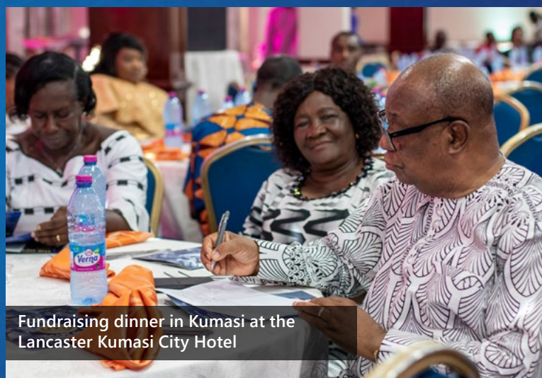
Fundraising dinner in Kumasi at the Lancaster Kumasi City Hotel