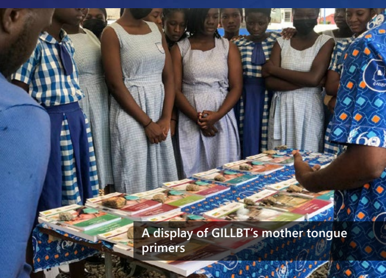
A display of GILLBT's mother tongue primers