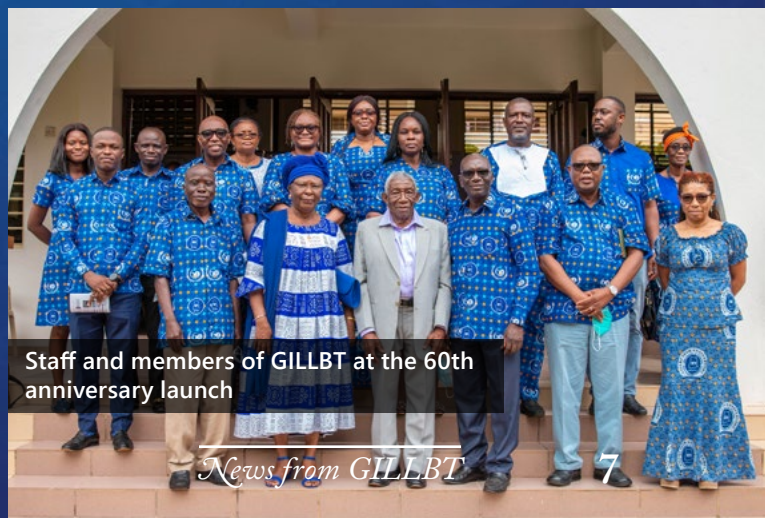
Staff and members of GILLBT at the 60th anniversary launch