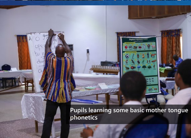
Pupils learning some basic mother tongue phonetics