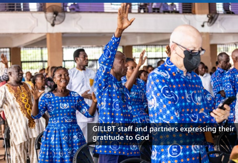
GILLBT staff and partners expressing their gratitude to God

The Wind and Fire Assemblies of God Church in Tamale, hosted staff, partners and members of GILLBT on Sunday, December 11, 2022, for the anniversary thanksgiving service.