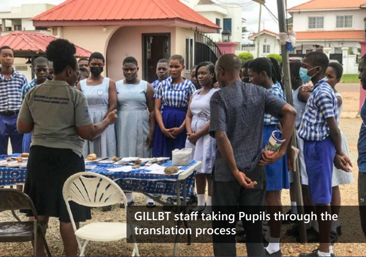
GILLBT staff taking Pupils through the translation process

Attendees watched a video of the Bible translation process and other impact stories and interacted with some staff of GILLBT. To many of them, the event gave them an up-close experience, was educative and an eye-opener to the work of Bible translation.