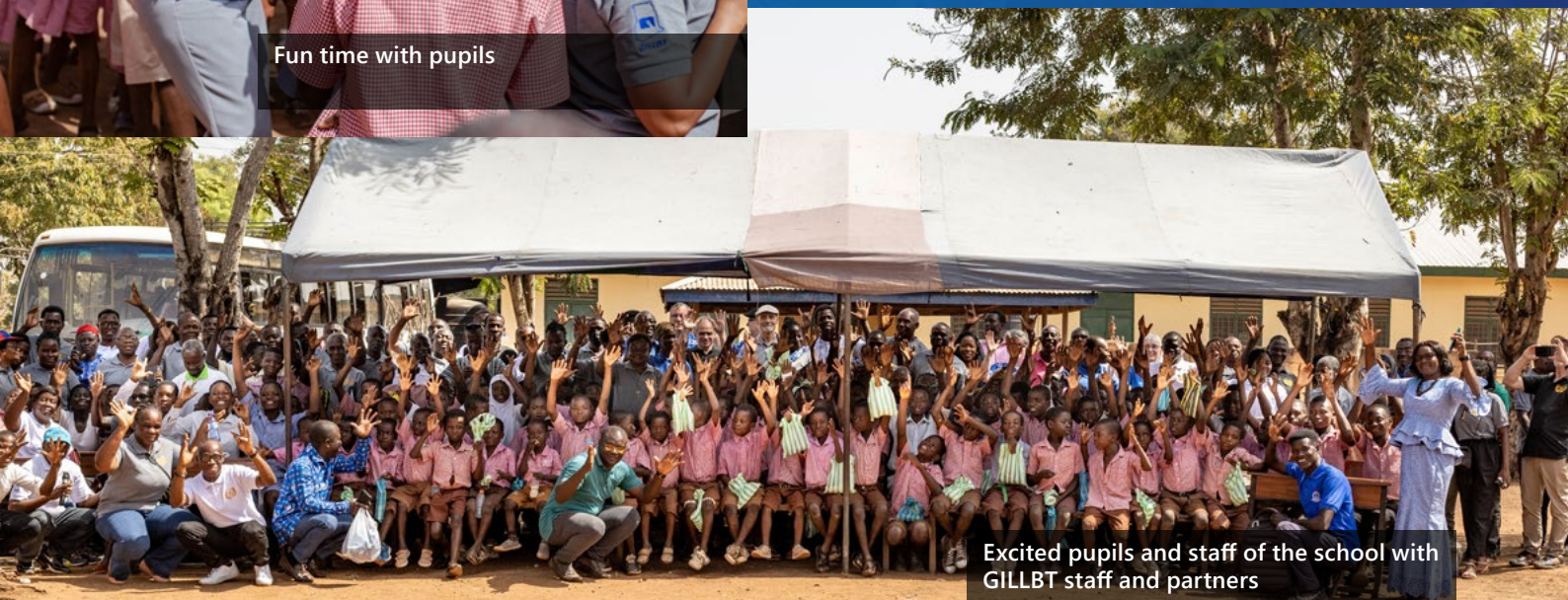
Excited pupils and staff of the school with GILLBT staff and partners

She also shared her joy with GILLBT as we mark 60 years and applauded our work, especially in sign language.