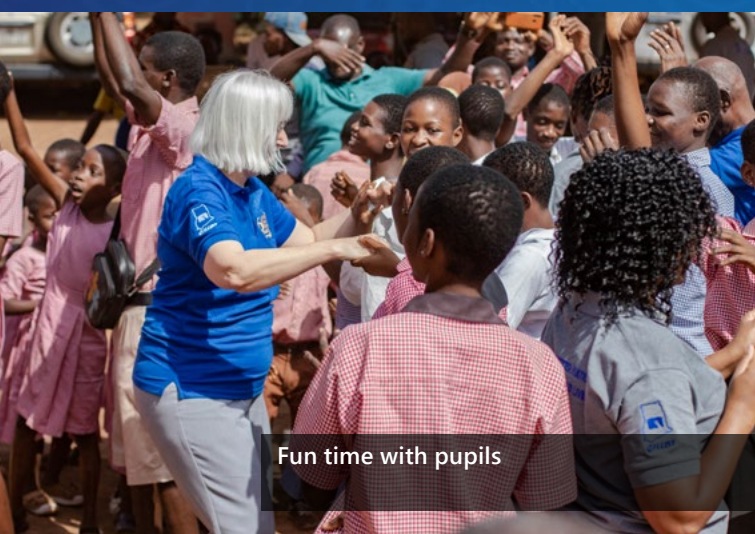
Fun time with pupils

In the early hours of Saturday, December 10, 2022, some GILLBT staff, members and partners visited the staff and pupils of the Savelugu School for the Deaf in Savelugu in the Northern region of Ghana.