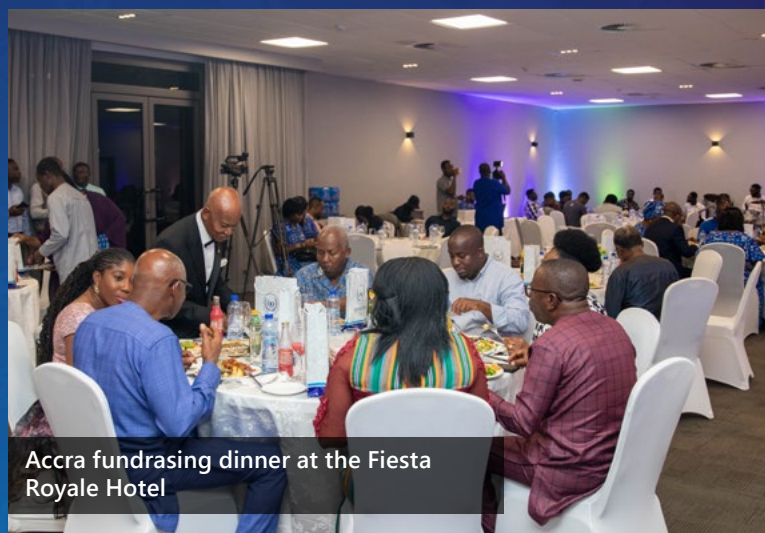
Accra fundraising dinner at the Fiesta Royale Hotel