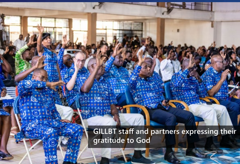
GILLBT staff and partners expressing their gratitude to God