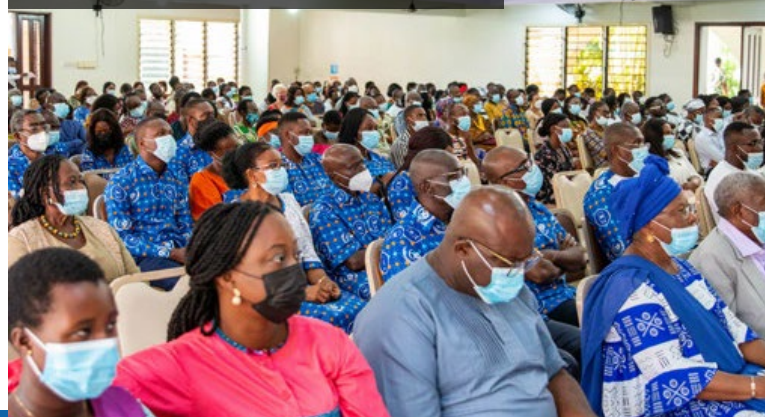
Legon Interdenominational Church is among the Churches in Ghana supporting mother tongue Bible translation.