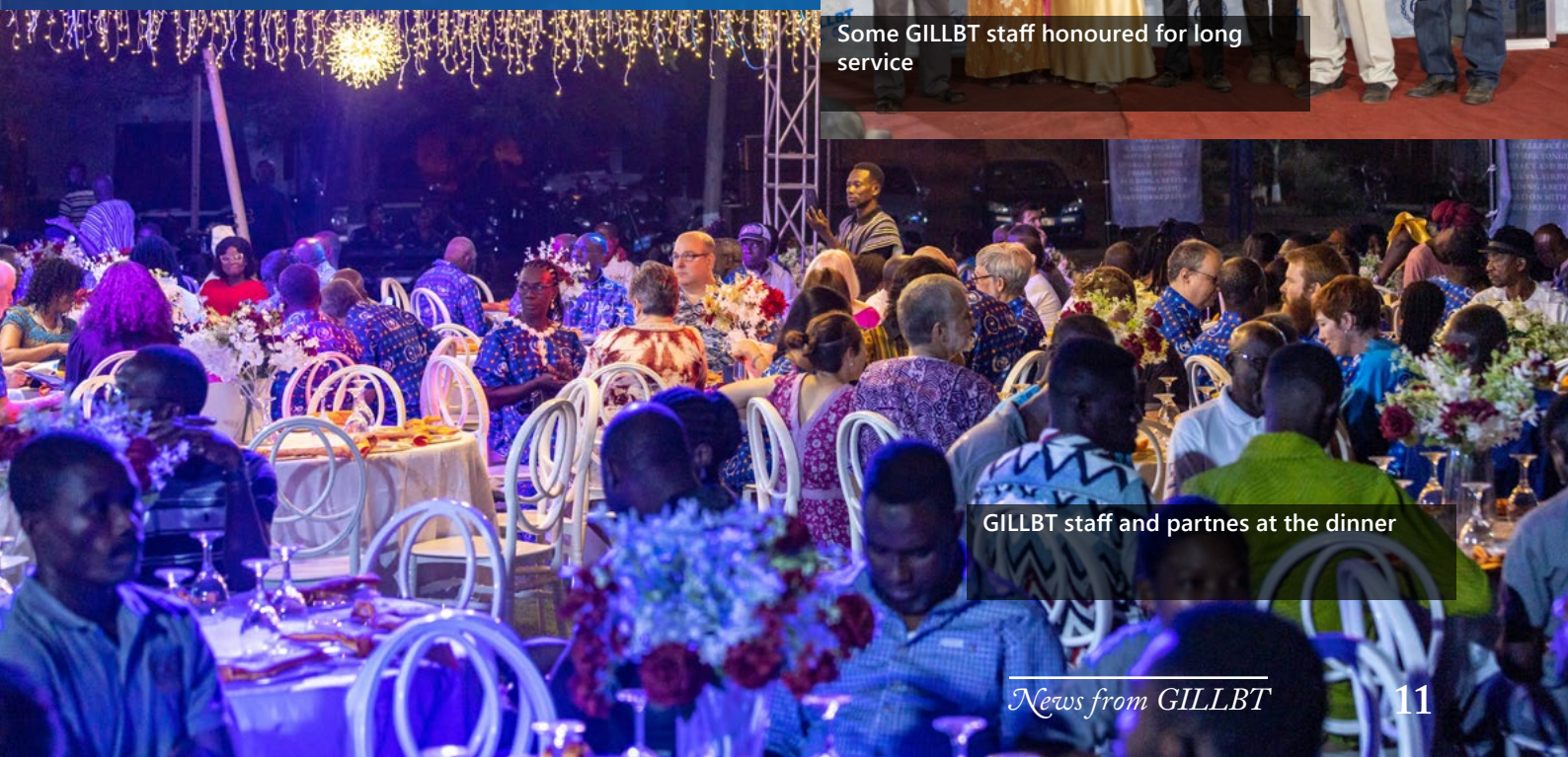
GILLBT staff and partners at the dinner