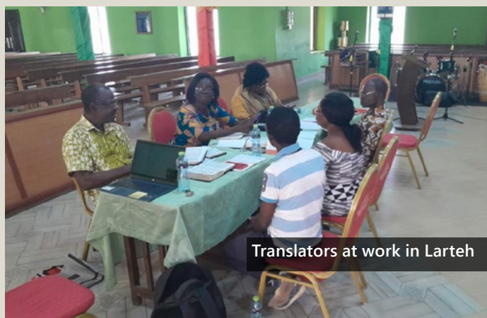
Translators at work in Larteh