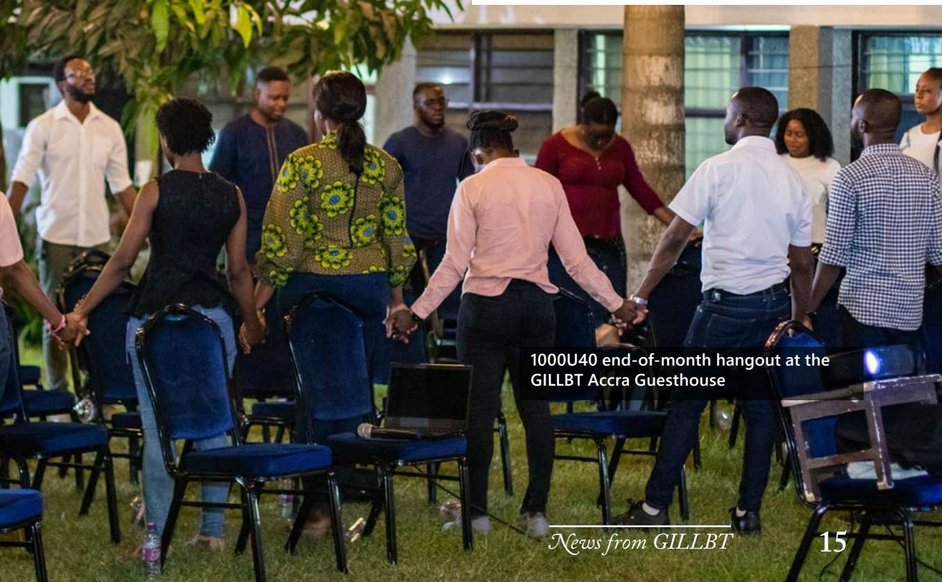
1000U40 end-of-month hangout at the GILLBT Accra Guesthouse