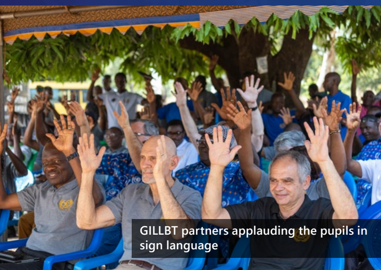
GILLBT partners applauding the pupils in sign language