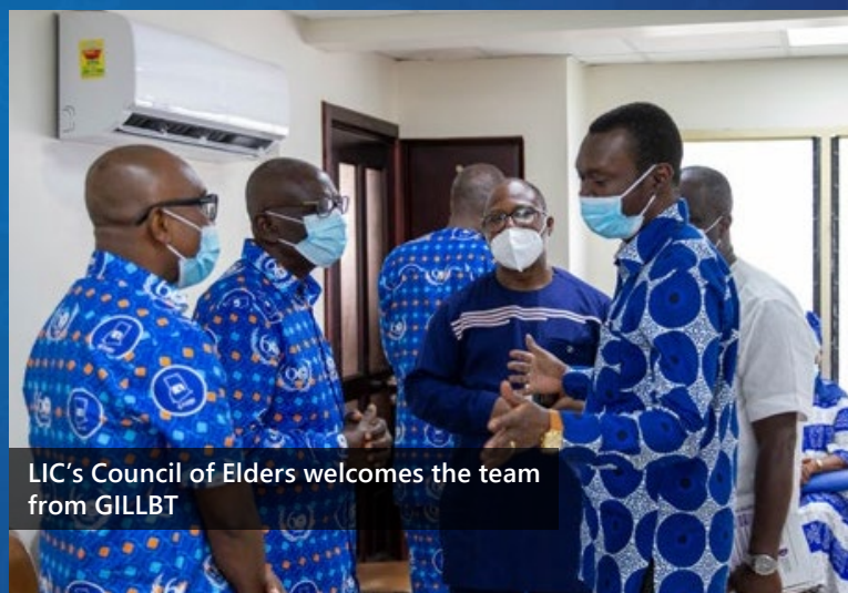
LIC's Council of Elders welcomes the team from GILLBT