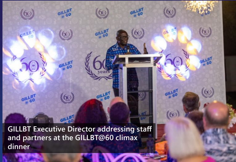
GILLBT Executive Director addressing staff and partners at the GILLBT@60 climax dinner

Partners took turns bringing messages of fraternal greetings and best wishes.