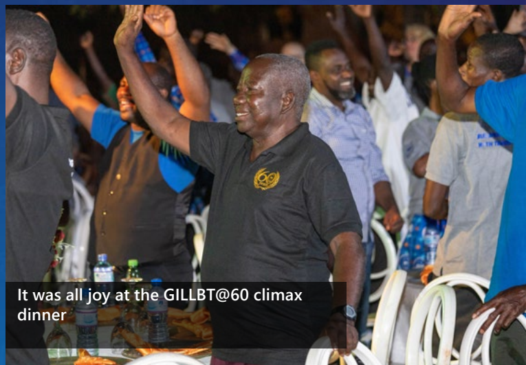
It was all joy at the GILLBT@60 climax dinner