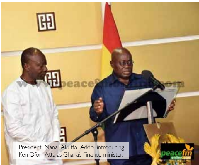
President Nana Akufo Addo introducing Ken Ofori-Atta as Ghana's Finance minister.

One of GILLBT's leading financial patrons and Christian businessman, Ken Ofori-Atta has been appointed as Ghana's finance minister. He assumed office after having been sworn-in on January 27, 2017, by the President of Ghana.