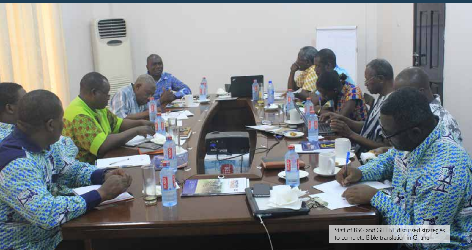
Staff of BSG and GILLBT discussed strategies to complete Bible translation in Ghana

O n May 12, 2017, the GILLBT Board approved a draft report of a joint Bible Society – GILLBT technical committee for GILLBT and the Bible Society of Ghana to work together on the remaining translation needs in the country.