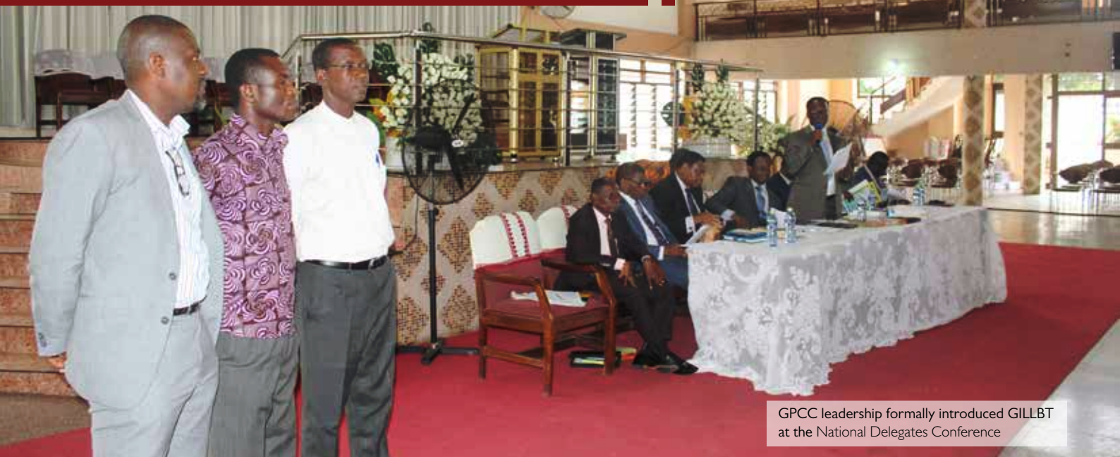
GPCC leadership formally introduced GILLBT at the National Delegates Conference