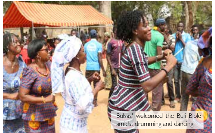
Bulsas' welcomed the Buli Bible amidst drumming and dancing