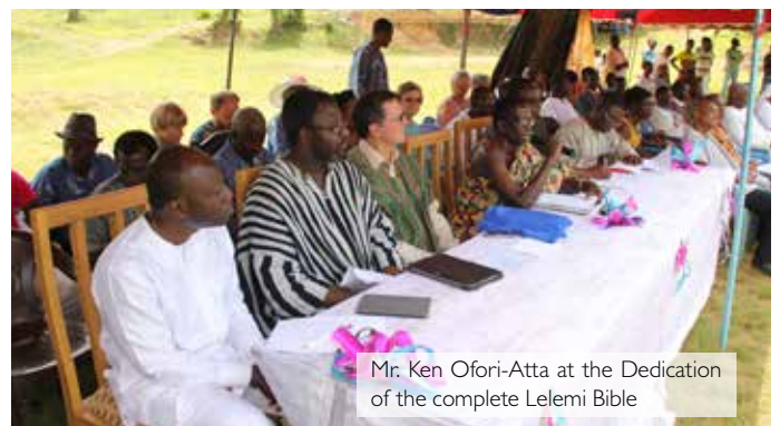
Mr. Ken Ofori-Atta at the Dedication of the complete Lelemi Bible

The entire leadership and membership of GILLBT congratulate Ken Ofori-Atta on his new position as Finance Minister, and pray for God's strength and wisdom for him.